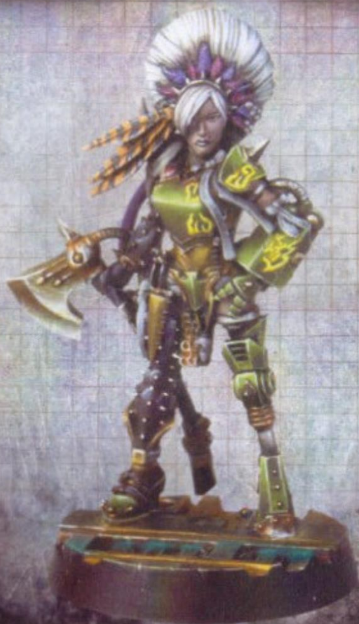
BELLADONNA NOBLE BOUNTY HUNTRESS