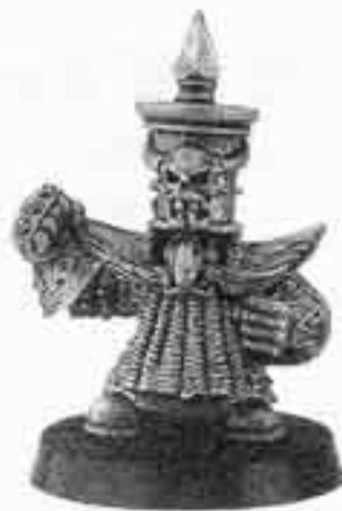
CHAOS DWARF BLOCKER 2 099903302