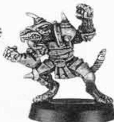
STORMVERMIN 1 099900407