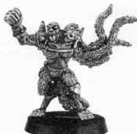
WITHERGRASP DOUBLEDROOL 073387/7