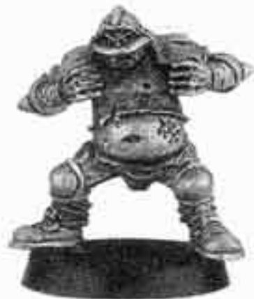
BILEROT VOMIT FLESH 073498/3