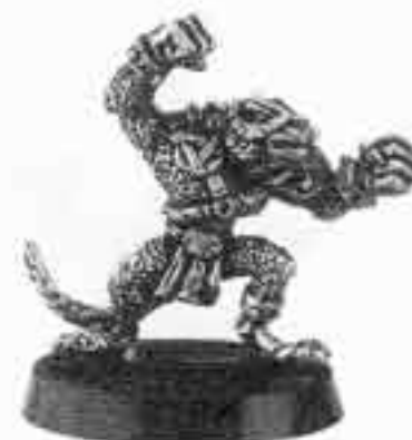
SKAVEN LINEMAN 3 099900402