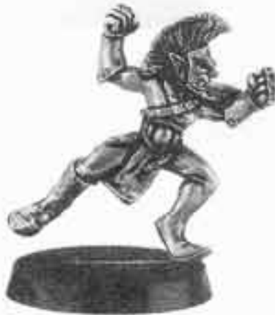
WARDANCER 1 099901206