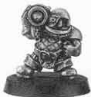
BARIK FARBLAST 073387/4

There are no official rules for these Star Players (designed for 2nd Edition Blood Bowl) but we thought you'd like to see them anyway. In the coming months, we hope the Citadel Journal will be producing some new rules for these great guys so give us a call on 0115 91 40000 for more details.