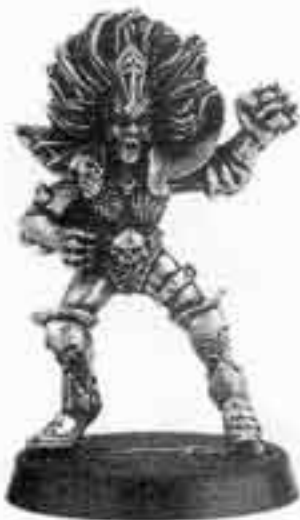
WITCH ELF 1 099900204