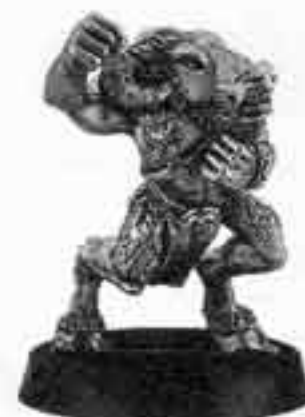
CHAOS BEASTMAN 4 099901105