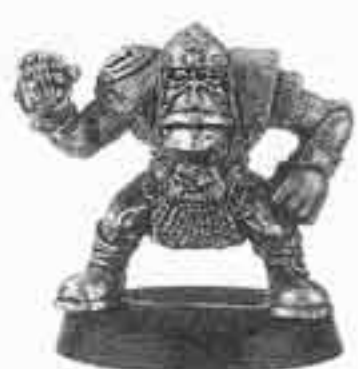
ORC LINEMAN 1 099900307