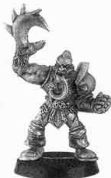
CHAOS MUTANT WITH CLAW & FOUL APPEARANCE 099903101