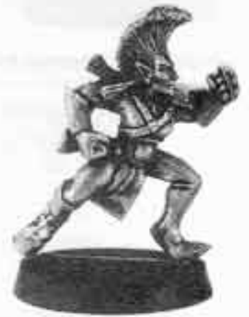
WARDANCER 2 099901207