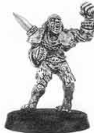
ZOMBIE 1 099901005