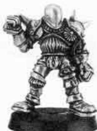
GALMEN GOREBLADE 073498/8