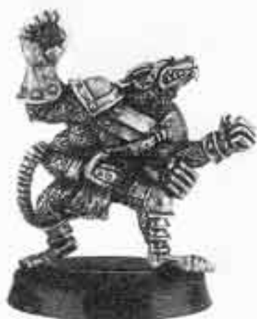
SKAVEN MUTANT WITH EXTRA ARM 099902702