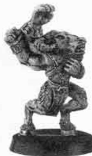
CHAOS MUTANT WITH EXTRA ARMS 099903103