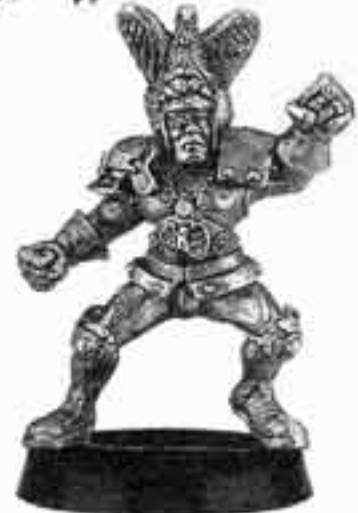
GRIFF OBERWALD 099900701