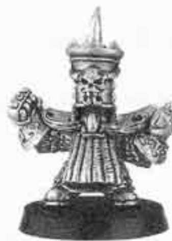
CHAOS DWARF BLOCKER 3 099903303