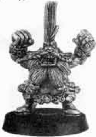
GRIM IRONJAW 099901801