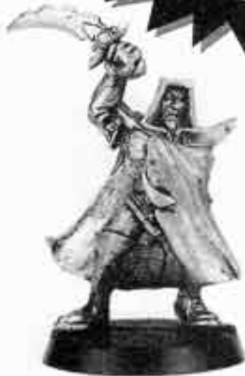
HORKON HEARTRIPPER 099901601