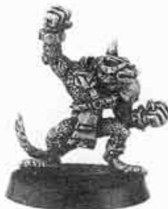
SKAVEN LINEMAN 2 099900403