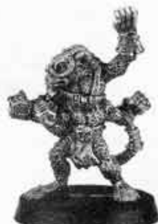
RASTA TAIL SPIKE 073387/19