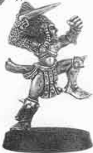
JORDELL FRESHBREEZE 099902901