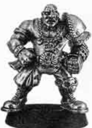
THE MIGHTY ZUG 099901301