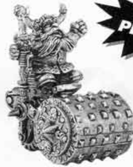
DWARF DEATH ROLLER