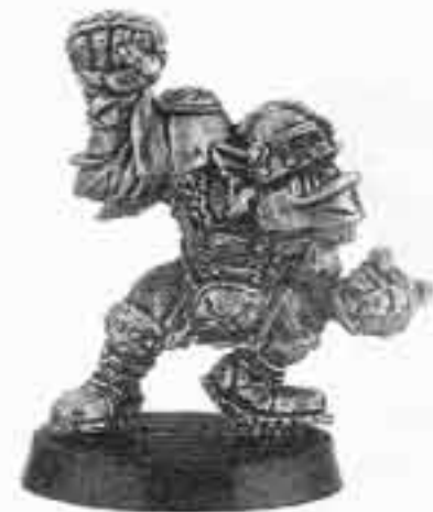
ORC BLITZER 3 099900305