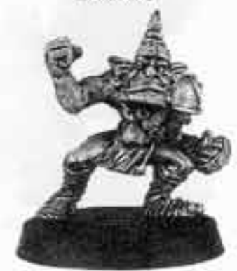
GOBLIN 5 099902505