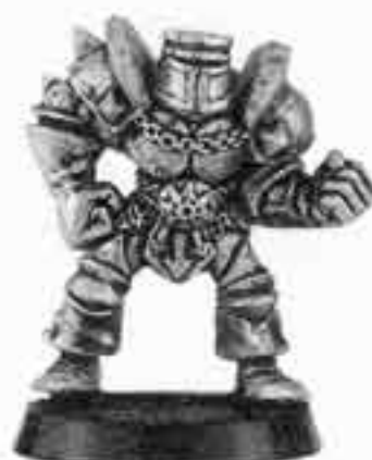
CHAOS WARRIOR 2 099901102