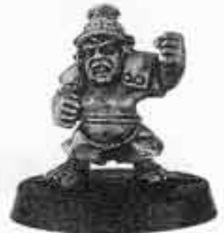
HALFLING 6 099902004