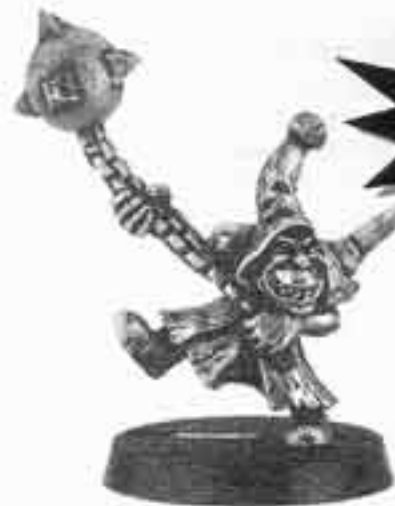
FUNGUS THE LOON 099902101