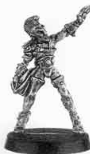
ELDRIC SIDEWINDER 073387/10