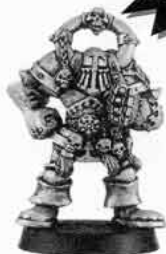
LORD BORAK THE DESPOILER 099902601