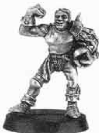
GREGOR MEISSAN 073387/3