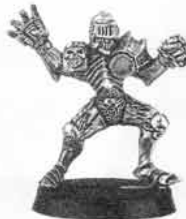
WIGHT 1 099901009