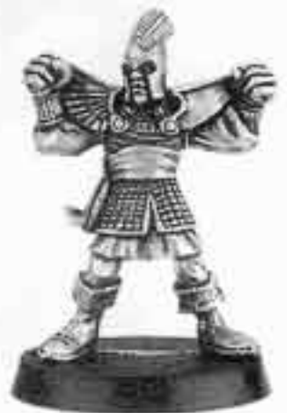
HIGH ELF LINEMAN 4 099900104