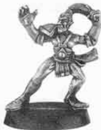
WOOD ELF CATCHER 2 099901205