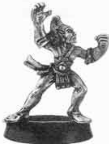
WOOD ELF CATCHER 1 099901204