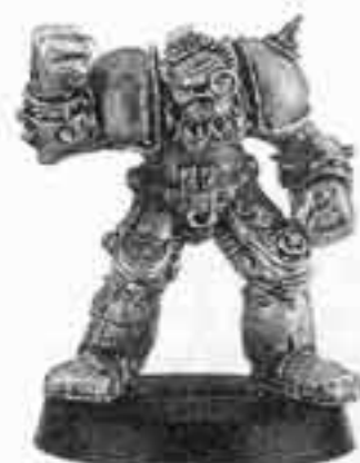
GREASER GEARGRINDER 073387/12