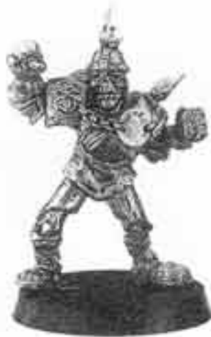
SKELETON 2 099901004