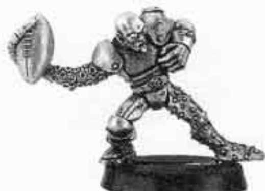
LEWDGRIP WHIPARM 073498/1