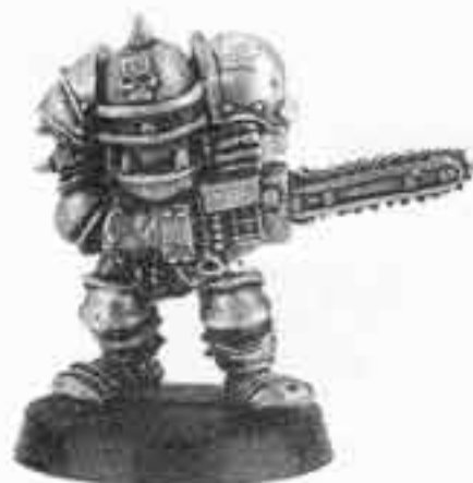
UGROTH 'RIPPER' BOLGROT 073387/18