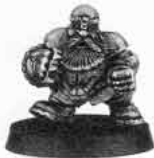
DWARF RUNNER 2 099900507