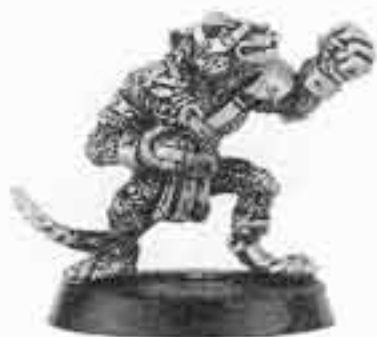
SKAVEN LINEMAN 1 099900401