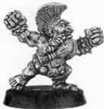
TROLLSLAYER 1 099900506