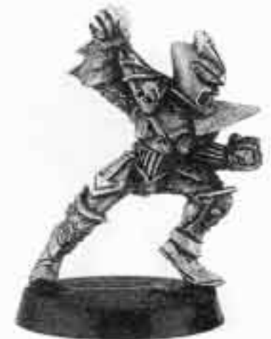
DARK ELF BLITZER 2 099900202