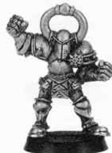
CHAOS WARRIOR 3 099901103