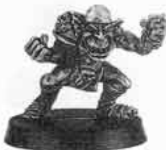
GOBLIN 1 099902501