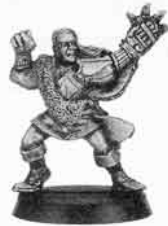
LION WARRIOR 1 099900109