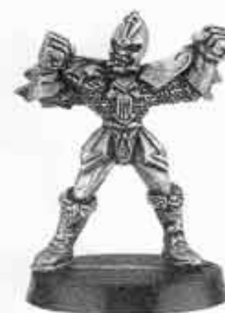
DARK ELF LINEMAN 2 099900207