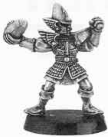
PHOENIX WARRIOR 099900105