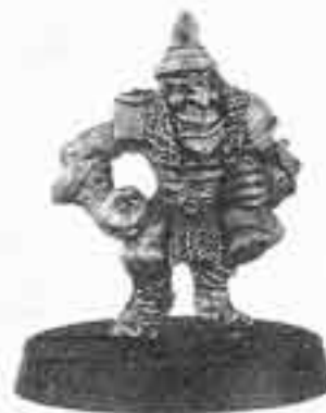
GOBLIN 3 099902503