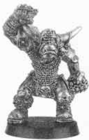
ORC BLOCKER 1 099900301