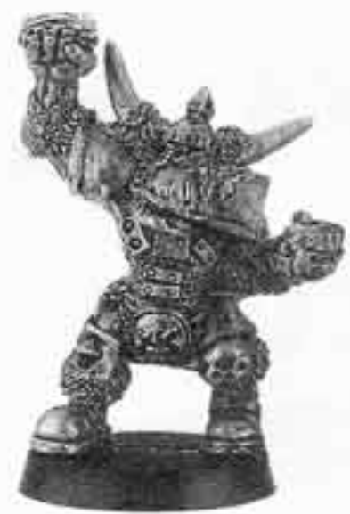
ORC BLOCKER 2 099900302