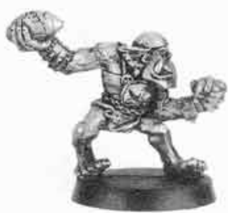
ORC THROWER 099900306