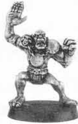
GHOUL 2 099901002