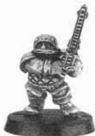
FLINT CHURNBLADE 073387/11