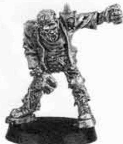
FRANK 'N' STEIN 073387/14