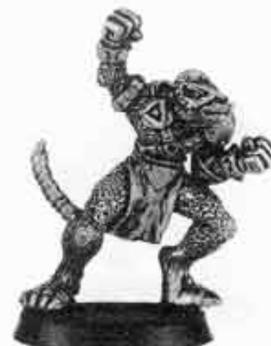
SKAVEN MUTANT WITH LONG LEGS 099902705