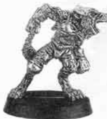
WILHELM CHANEY 073387/17