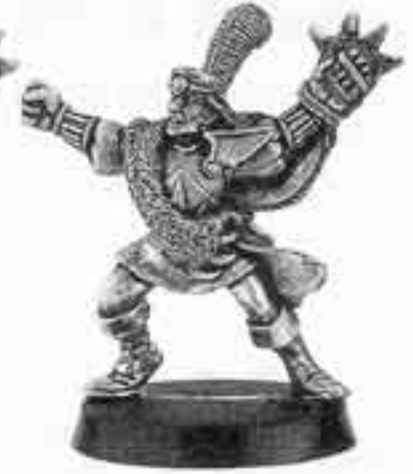
LION WARRIOR 2 099900107