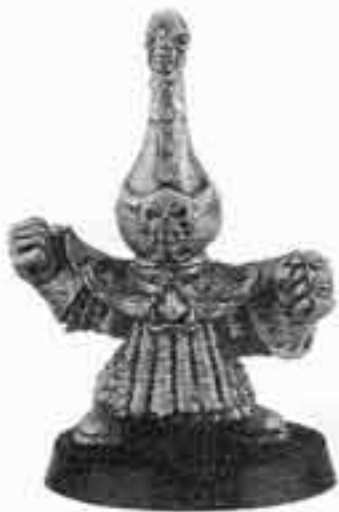
CHAOS DWARF BLOCKER 1 099903301

(This is just one of the range of Chaos Dwarf Blunderbuss miniatures available)