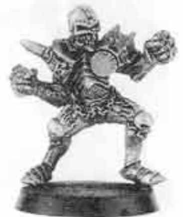
WIGHT 2 099901010