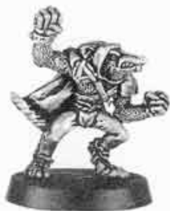
GUTTER RUNNER 1 099900404