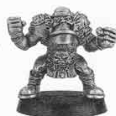
ORC LINEMAN 2 099900308