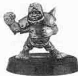
HALFLING 1 099902002

(This is a Warhammer Woodelf Treeman miniature used to represent Deeproot Strongbranch)