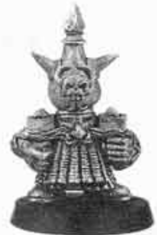
CHAOS DWARF BLOCKER 4 099903304