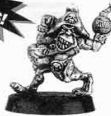
BOMBER DRIBBLESNOT 099902201