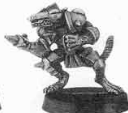
STORMVERMIN 2 099900408