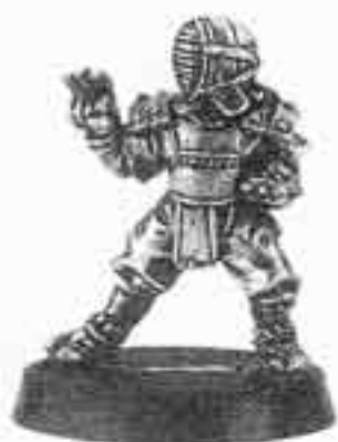
HOSHI KOMI 073387/2