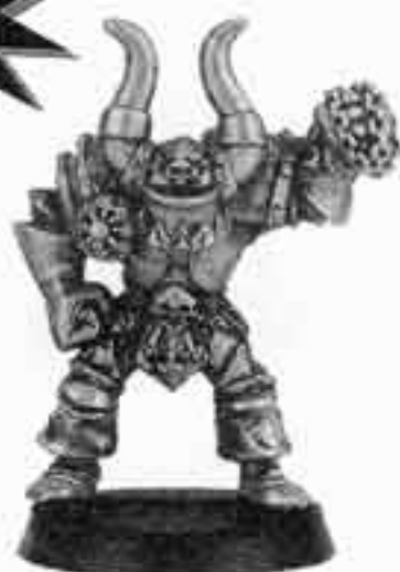
CHAOS WARRIOR 1 099901101