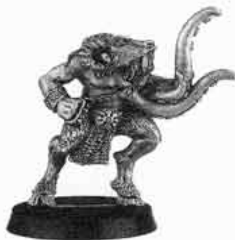
CHAOS MUTANT WITH TENTACLES 099903102