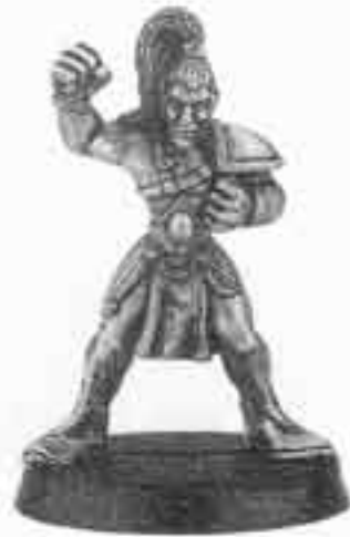
WOOD ELF LINEMAN 1 099901201