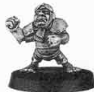
HALFLING 4 099902005