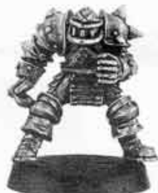
WORMHOWL GRAYSCAR 073498/5