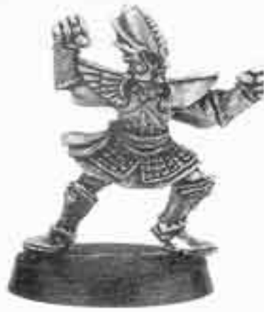
DRAGON WARRIOR 1 099900106