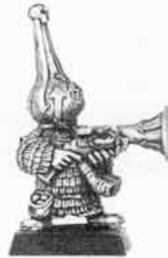
CHAOS DWARF BLUNDERBUSS 021100403

(This is just one of the range of Chaos Dwarf Blunderbuss miniatures available)