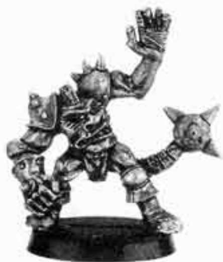
DIETER HAMMERSLASH 073387/6