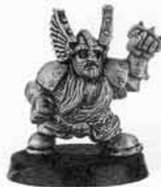
DWARF BLITZER 1 099900505