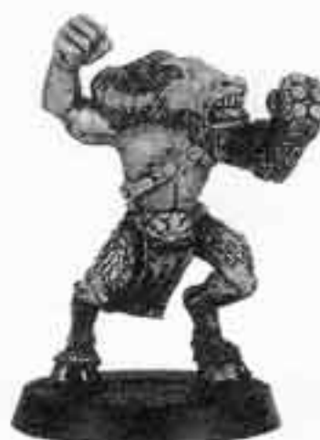
CHAOS BEASTMAN 3 099901104