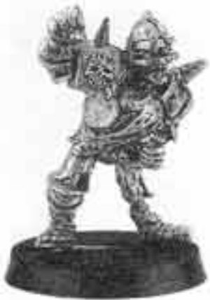
SKELETON 1 099901003