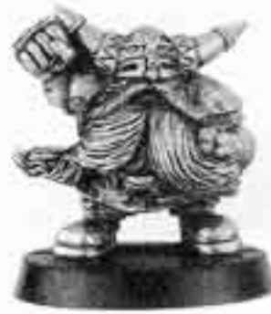
DWARF LONG BEARD 2 099900502