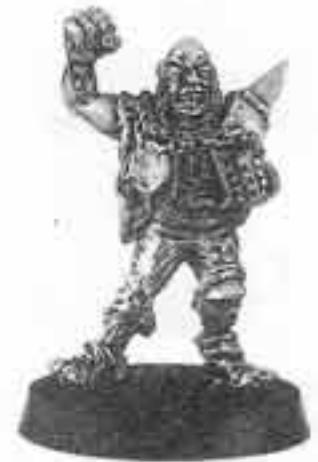
ZOMBIE 2 099901006