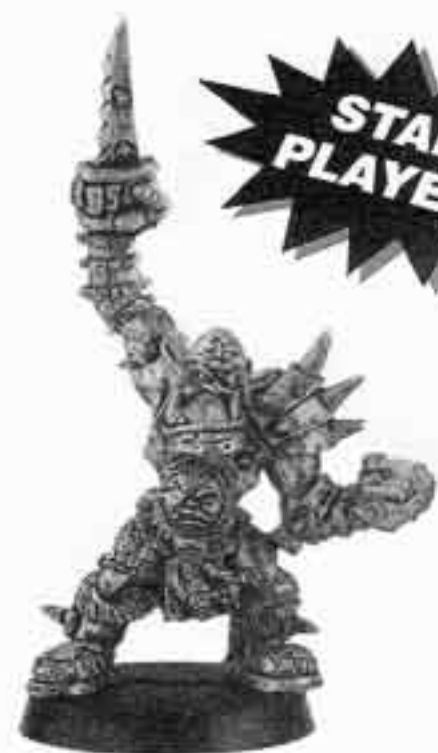
VARAG GHOUL-CHEWER 099901401

The Orcland Raiders Team consists of 5 Lineman, 3 Blitzers, 1 Thrower and 2 Black Orc Blockers.