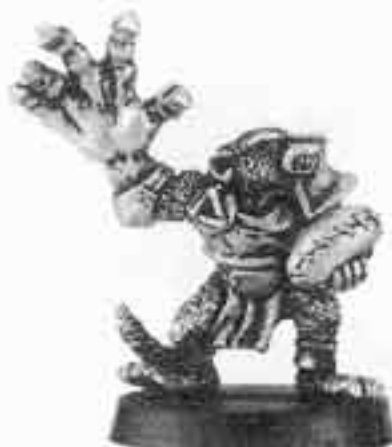
SKAVEN MUTANT WITH BIG HAND 099902704