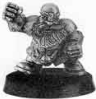
DWARF RUNNER 1 099900504