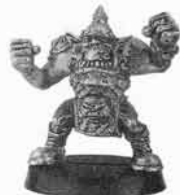
ORC LINEMAN 3 099900309