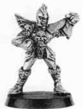
DARK ELF LINEMAN 3 099900208