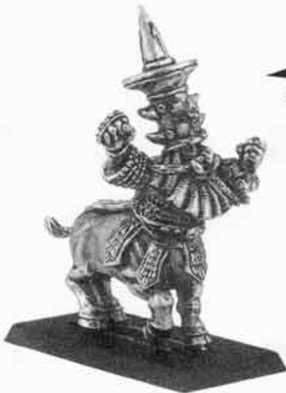
HTHARK THE UNSTOPPABLE

The Zharr-Naggrund Ziggurats team consists of 8 Hobgoblins and 4 Chaos Dwarf Blockers.