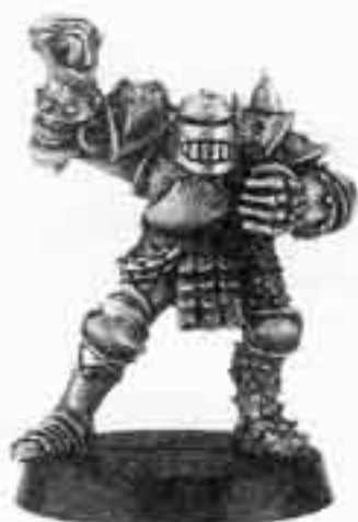
DUKE LUTHOR VON HAWKFIRE 073498/7