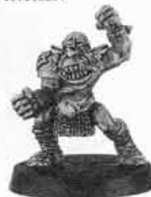
GOBLIN 4 099902504