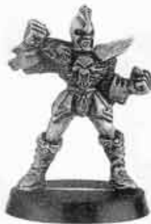
DARK ELF LINEMAN 1 099900206