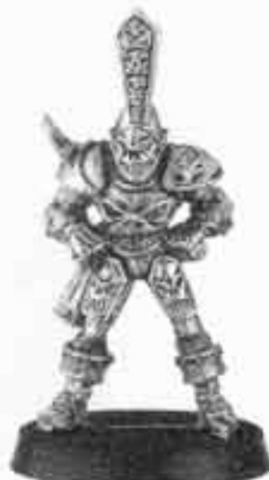
TUERN REDVENOM 073387/5