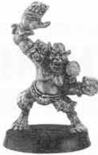
GHOUL 1 099901001