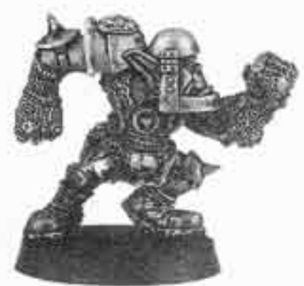
ORC BLITZER 1 099900303