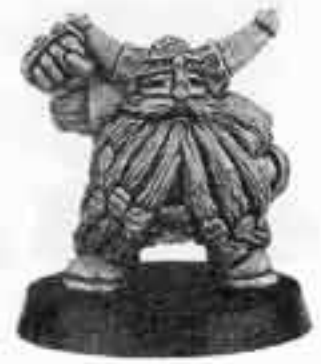
DWARF LONG BEARD 3 099900503