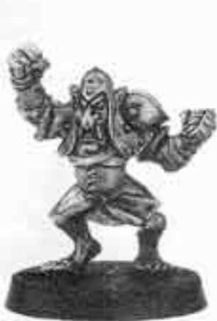
HOBGOBLIN 1 099903403