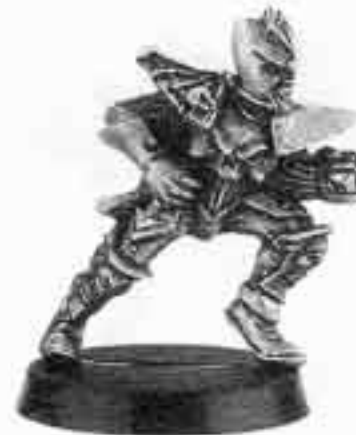
DARK ELF BLITZER 1 099900203