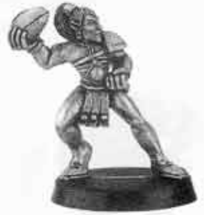
WOOD ELF THROWER 099901203