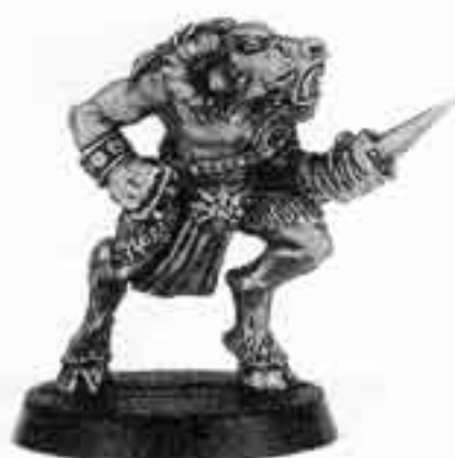
CHAOS BEASTMAN 1 099901106