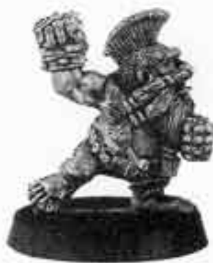
TROLLSLAYER 2 099900509