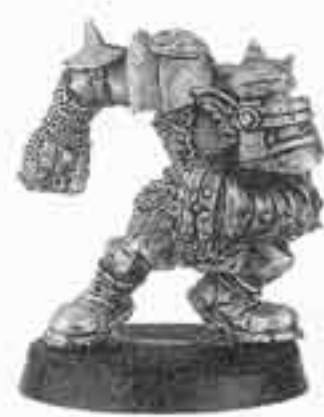
ORC BLITZER 2 099900304