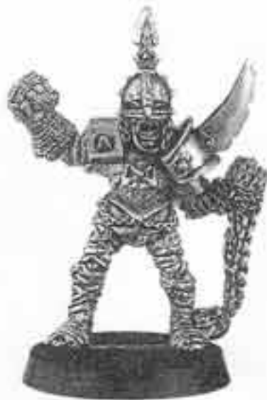
MUMMY 2 099901008