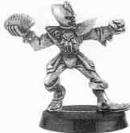
DARK ELF THROWER 099900201