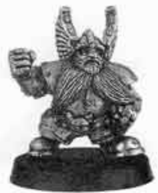
DWARF BLITZER 2 099900508