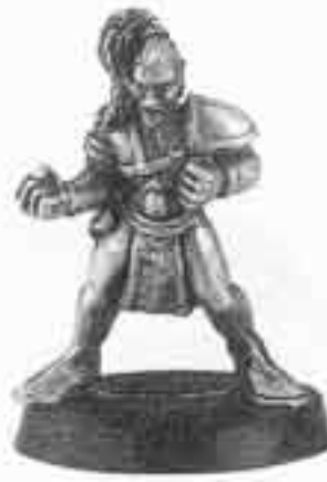
WOOD ELF LINEMAN 2 099901202