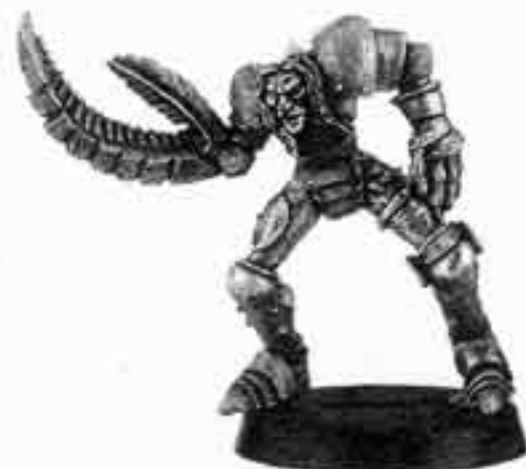
DORJAK SURECLAW 073498/4