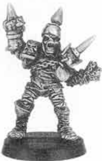
MUMMY 1 099901007