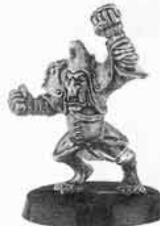
HOBGOBLIN 3 099903401