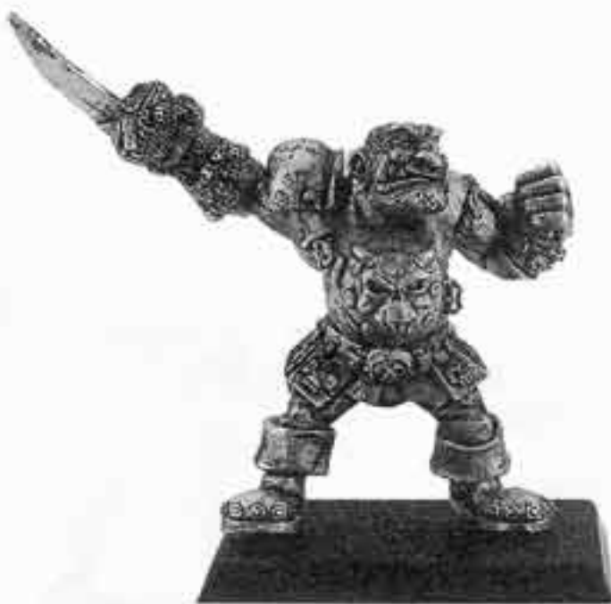
MORG 'N' THORG