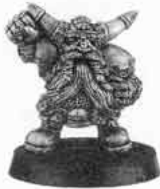
DWARF LONG BEARD 1 099900501