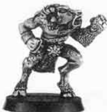
CHAOS BEASTMAN 2 099901107