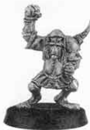
HOBGOBLIN 2 099903402