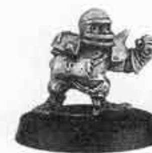
HALFLING 5 099902006