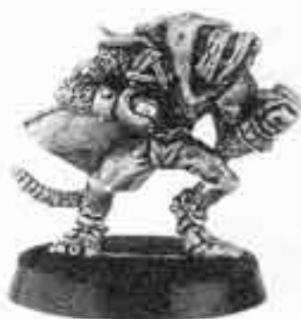
GUTTER RUNNER 2 099900405