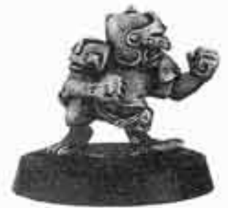
HALFLING 3 099902003