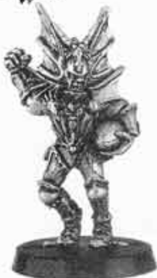
PRINCE MORANIAN 099901701

The Galadrieth Gladiators team consists of 7 Linemen, 1 Phoenix Warrior, 2 Lion and 2 Dragon Warriors.