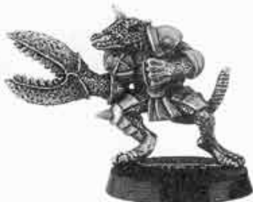
SKAVEN MUTANT WITH CLAW 099902703