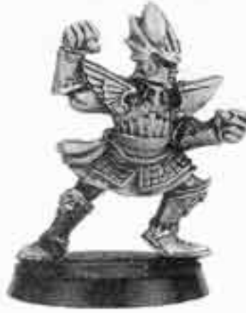
DRAGON WARRIOR 2 099900108