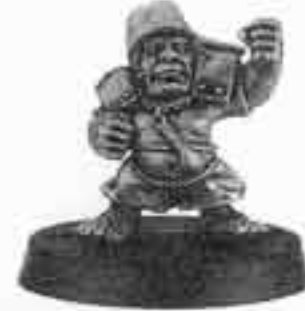
HALFLING 2 099902001