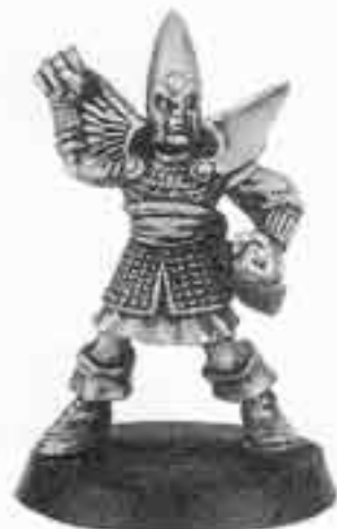
HIGH ELF LINEMAN 1 099900101