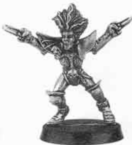
WITCH ELF 2 099900205