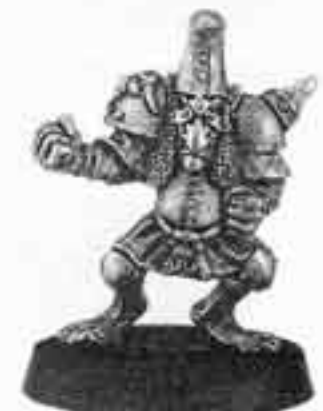
HOBGOBLIN 4 099903404