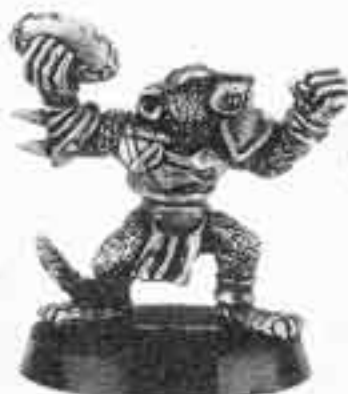
SKAVEN THROWER 099900406