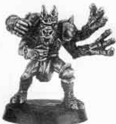
SLARGA FOULSTRIKE 073387/16